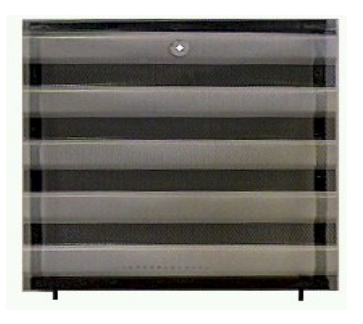
MADE IN USA