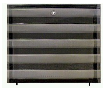
MADE IN USA

FITS: 150, 165, 175, 180, 1080, Ind. 30, 31, 3165